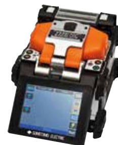
Sumitomo T-71C Fusion Splicer - Core Alignment. Kit complete with cleaver