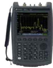
Keysight N9912A FieldFox RF Cable/Antenna Analyzer 4Ghz