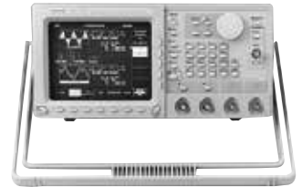
Tektronix AWG2021 Arbitrary Waveform Generator - 200Mhz - 2 channels