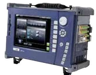
Viavi Solutions MAP-230 3-slot Mainframe and display