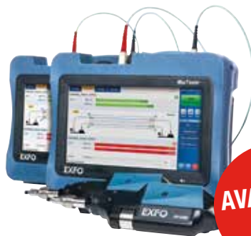
Exfo MAX-940 Fiber Certifier OLTS