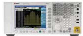
Keysight N9030A PXA Signal Analyser - 3Hz - 8.4GHz (Various configurations)