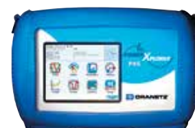
Dranetz PX5 Power Xplorer AC-Power Analyser 4 + 4 Channel 50/60Hz