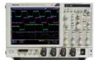
Tektronix DP071604C Digital Phosphor Mixed Signal Oscilloscope 16GHz 4+16 channels