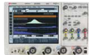
Keysight DSAX92504A Infiniium Oscilloscope - 25GHz - 4 channels

Additional configurations available upon request. Please call for specific rental rates.