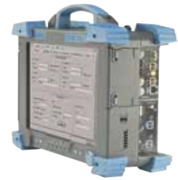
Exfo FTB5800 CD Analyser Module