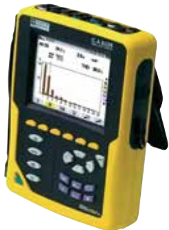
Chauvin Arnoux CA-8336 Power Quality Monitor