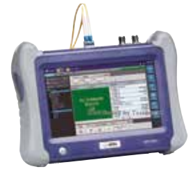
Viavi Solutions MTS5800 MTS-5812P SDH + PDH and 1 & 10Gig Ethernet Tester