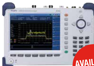
Viavi JD-745A Base Station Analyser W-CDMA and LTE