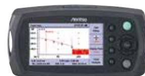
Anritsu MT9090 μOTDR 1310/1550/1625 - 38/37/35dB