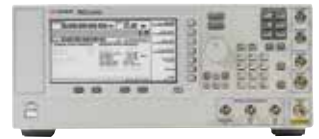
Keysight E8257D PSG Analog Signal Generator - 20GHz