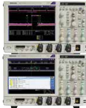
Tektronix MS072004C MSO/DP070000 Series oscilloscopes'