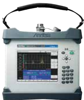
Anritsu MW82119A PIM Master Passive Intermodulation Analyser