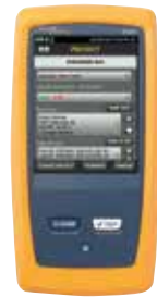
Fluke DSX5000 DSX Cable Analyser for CAT5/6/7