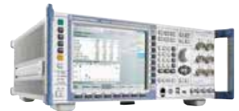
Rohde & Schwarz CMW500 Mobile Wireless Connectivity Tester (Various configurations available)