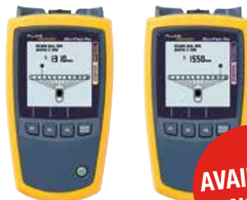
Fluke MultiFiber Pro Optical Power Meter and Source