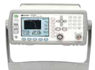
Keysight N1911A P-Series Power Meter Single Channel