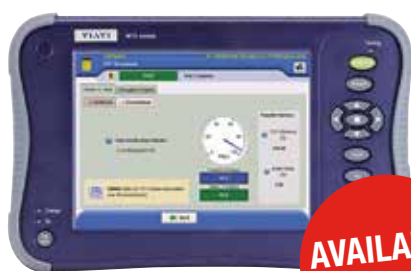
Viavi OSA-601 High Resolution Optical Spectrum Analyzer