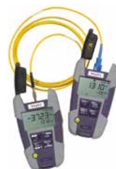
Viavi Solutions OMK38 Optical Loss Test Set Single Mode HiPower