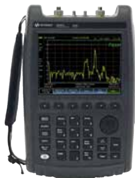
Keysight N9918A FieldFox Microwave Analyzer - 26,5GHz