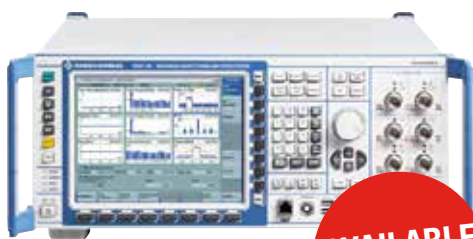
Rohde & Schwarz - CMW-500 Wideband Radio Communication Tester